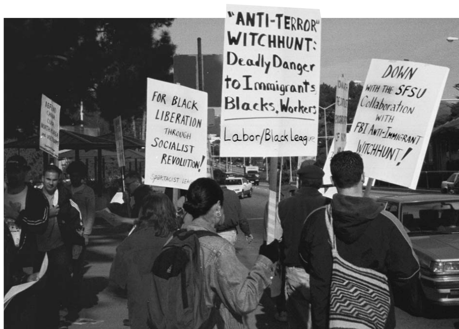
Bay Area Spartacus Youth Club initiated San Francisco State protest last December against anti-immigrant witchhunt. Protesters chanted: “Down with la migra! Full citizenship rights for all immigrants!”

For other sections of the bourgeoisie, more significant than the loss of short-term cash flow from students’ tuition is that the new INS decree—along with other border restrictions imposed post-September 11—crimps the exploitation