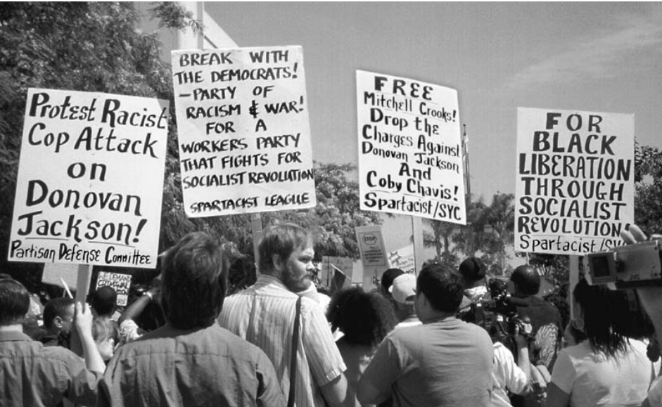
Inglewood: SL/SYC contingent at protest against cop terror, July 12.