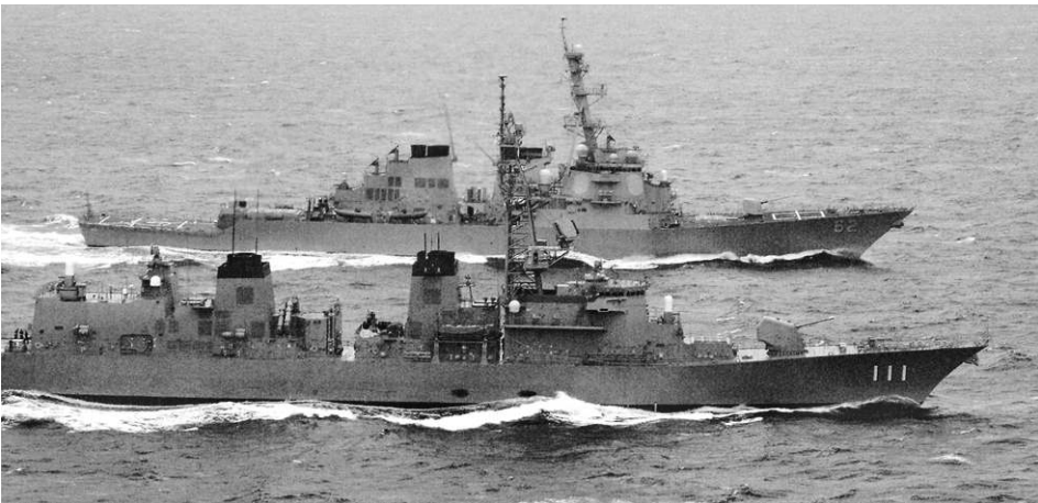
December 2007: U.S. and Japanese warships practice anti-submarine maneuvers in Pacific. U.S.-Japan military alliance is directed against Chinese deformed workers state.

However, the sheer magnitude of the U.S. trade deficit on the one side and the enormous stock of depreciating U.S. Treasury IOUs in the coffers of the People’s Bank of China on the other make this arrangement increasingly untenable. Pressure is mounting in Washington for anti-China trade protectionism, especially since the Democrats won the 2006 Congressional elections. Liberal politicians and union bureaucrats use China-bashing to deflect working-class discontent over stag-