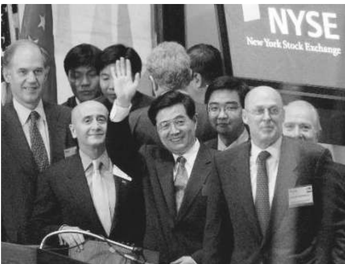
Hu Jintao, now Chinese president, visiting Wall Street, April 2002.

spending: the People’s Republic of China.”