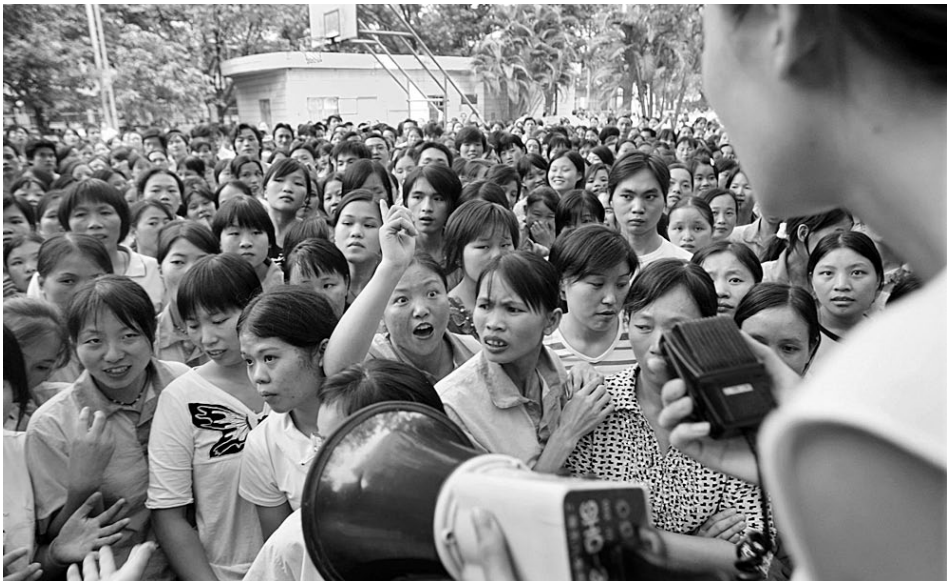
China Photos photos