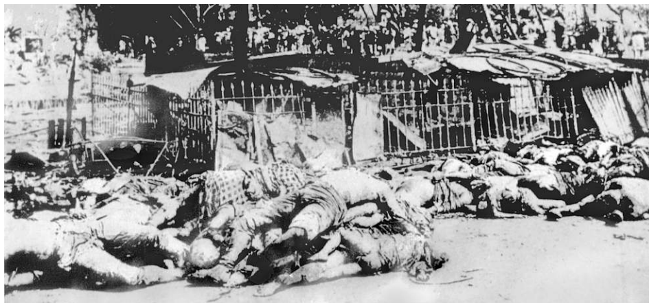
Following 1923 Great Kanto Earthquake, which devastated Tokyo, some 6,000 Koreans were massacred in state-sponsored pogrom.

In Japan the bourgeoisie is represented in politics by both the Liberal Democratic