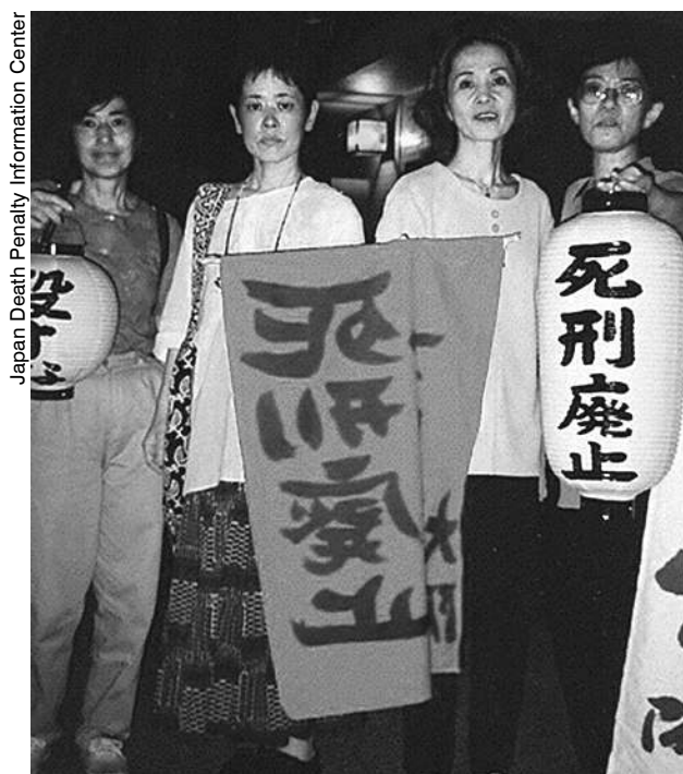
Protesters outside Osaka detention center call to abolish the death penalty.