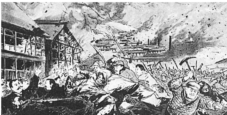
Painting of 1907 Ashio copper miners strike. More than 3,000 miners battled military, police.