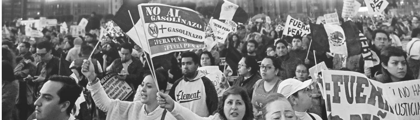
Mexico City, January 9: Mass protest against fuel price hikes.

The almost complete media blackout of the protests in the U.S. is not an accident. The U.S. imperialist rulers are clearly worried about continuing instability south of the border and want to keep working people in the U.S. ignorant of the struggles by their Mexican class brothers and sisters. Helping to fuel the protests in Mexico is the enormous fear and loathing provoked by newly elected president Donald Trump, who has missed no opportunity to revile the Mexican people. Trump's protectionist tirades have already caused Ford and GM to reconsider investment in Mexico, while the Mexican peso, already on a slide, has hit all-time lows in recent weeks following anti-Mexico pronouncements by Trump and his new secretary of commerce. The multiracial U.S. proletariat has a particular obligation to oppose the depredations of the U.S. imperialist behemoth, which has condemned millions of Mexican workers and peasants to hun-