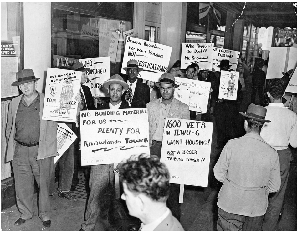
Oakland, 1946: Integrated protest by veterans, including ILWU warehouse workers, demands affordable housing.

When workers become the ruling class, the housing crisis, insoluble on the basis of capitalist private property, will be resolved in a straightforward way. Taking the banks, factories, transportation and land away from their profit-driven owners, a workers state will institute a planned, collectivized economy. Homelessness will be tackled overnight, simply by requisitioning the mansions, luxury hotels and real estate holdings of the former capitalist rulers so that everyone has a place to live. As society’s productive forces are rationally developed in the interests of all, poverty and inequality will be overcome. ■