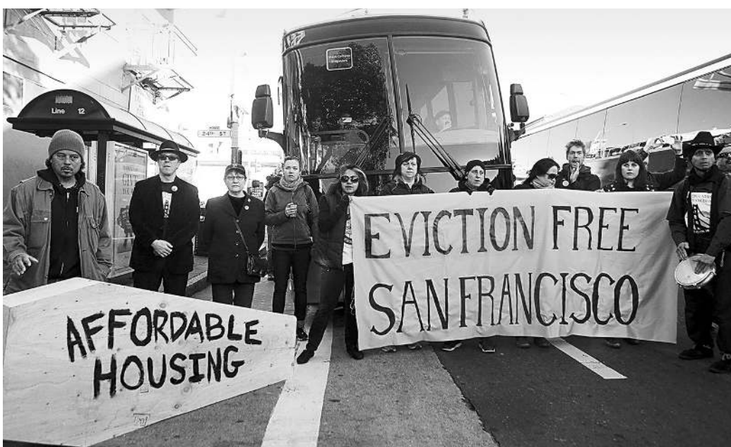
San Francisco, December 2013: Anti-eviction protesters block private bus transporting Silicon Valley techies for Apple.