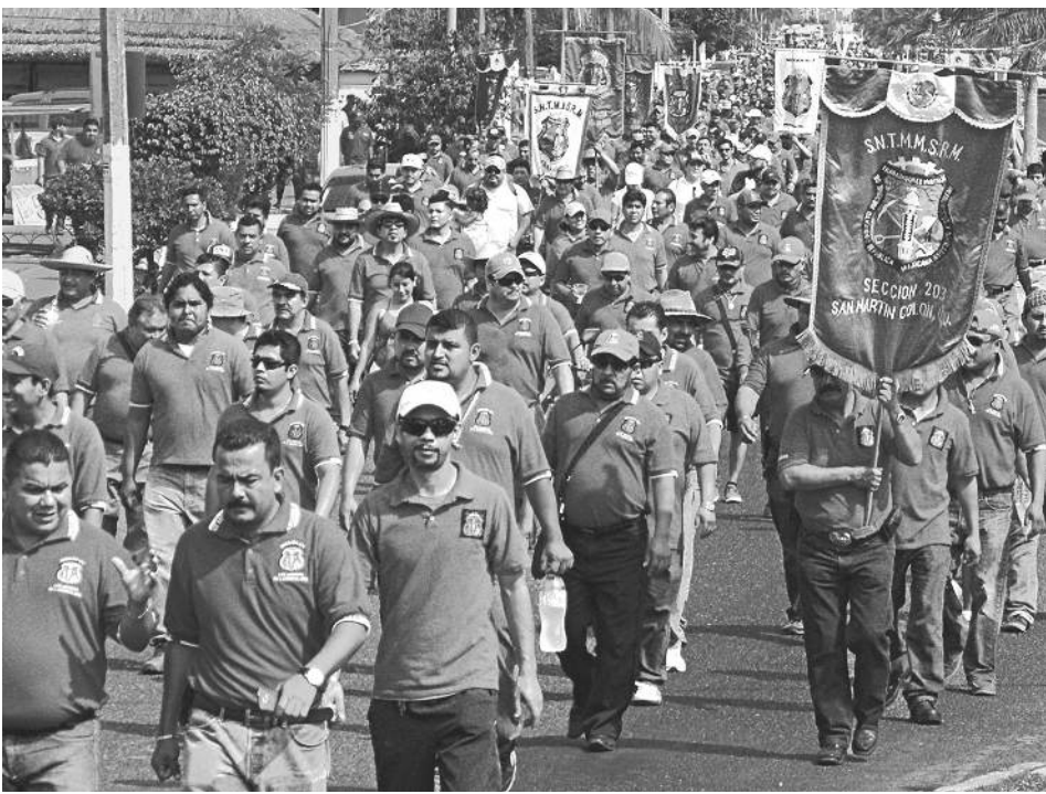
Mexican steel workers march in Lázaro Cárdenas shortly after victorious strike against ArcelorMittal, April 2016. Social power of proletariat must be mobilized to beat back capitalist offensive against workers, poor.

The government, which is trying to sell the rights to the oil platforms, has launched the current attack to undo petroleum price controls in order to increase the profitability of the oil assets they are putting on the auction block. They need to demonstrate that their imperialist masters will be able to make enough money from the blood, sweat and tears of the Mexican masses. This is also an attack against the oil workers union. Carlos Loret de Mola of Televisa [giant media company] ranted that behind the “chaos” caused by the