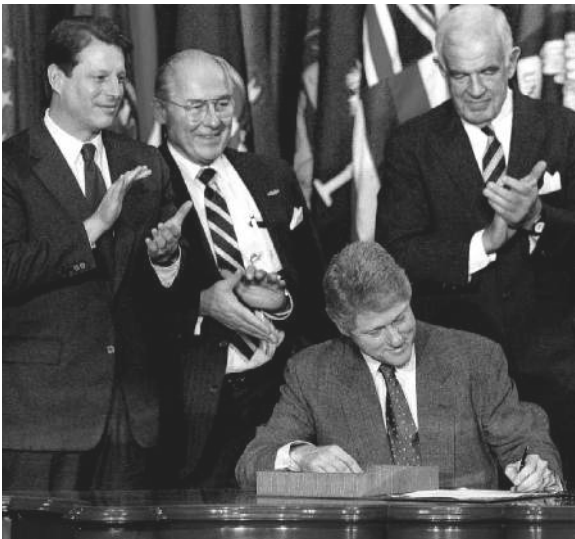
Left: President Clinton signs NAFTA into law, December 1993. Right: Joint statement by U.S., Canadian and Mexican sections of ICL denouncing start of “free trade” negotiations, 1991.

that it is necessary to destroy the corporatist unions from within—i.e., do the bosses’ dirty work for them. The GI also explained in its revised leaflet, “Local 22 of the dissident teachers can be instrumental in making a joint struggle of diverse guilds of workers against the government offensive a reality.” The CNTE teachers of Local 22—which the GI has tailed for years—is tied to the bourgeois caudillo AMLO through its own bureaucracy. Of course, the GI does not mention the