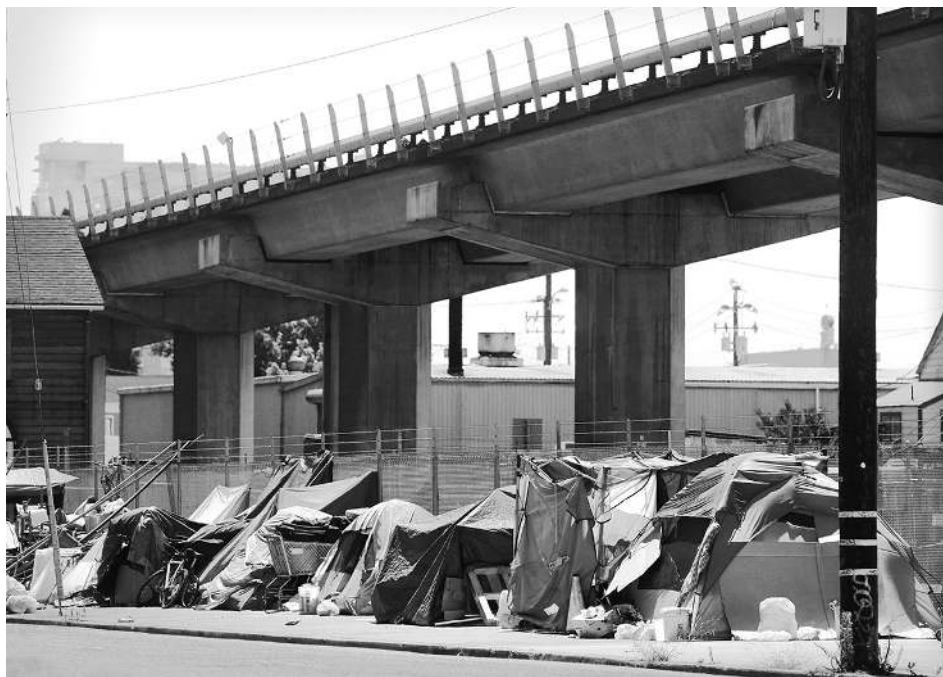
One of many homeless encampments in Oakland, July 2016.