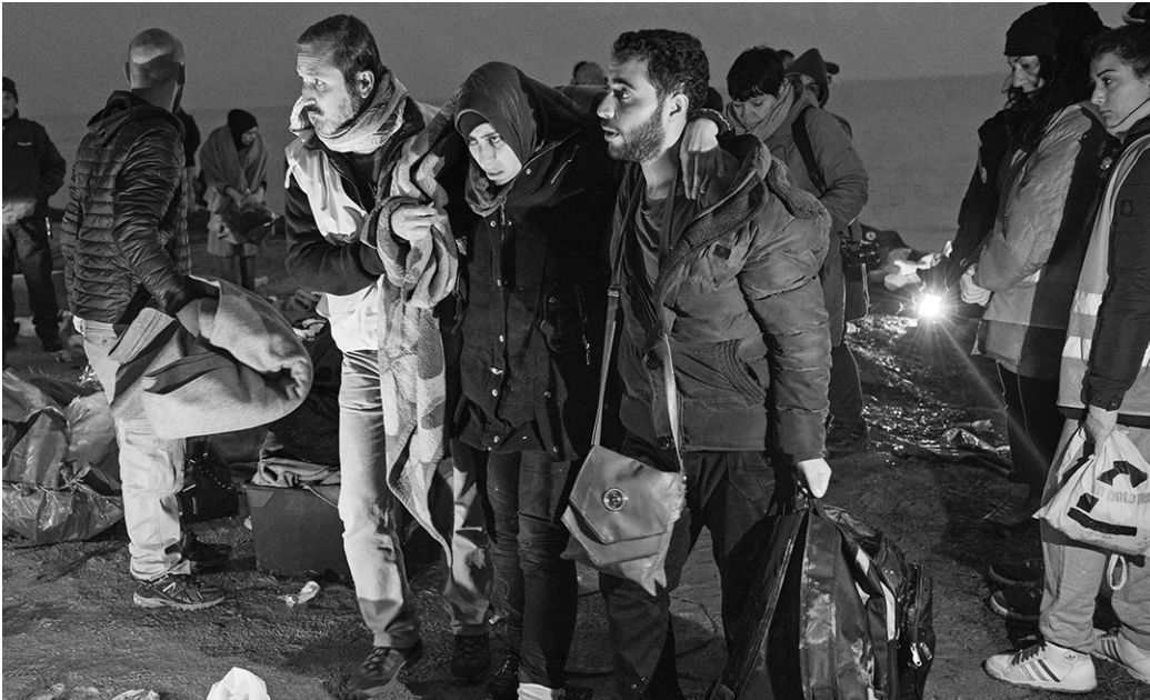
Migrants on Greek island of Lesbos after perilous night journey across Aegean Sea, March 2016.

A key factor enabling the imperialists to rampage even more freely throughout the world was the collapse of the Soviet degenerated workers state in 1991-92. Capitalist counterrevolution in the Soviet Union was a catastrophe for the working people across the globe. For the imperialist powers, especially the dominant U.S., it meant they no longer felt constrained by the threat of Soviet military might and were therefore emboldened to carry out more wars of plunder against semicolonial countries. The International Communist League (Fourth Internationalist), of which the TOE is the Greek section, fought to the end to defend the Soviet Union against imperialism and internal counterrevo-