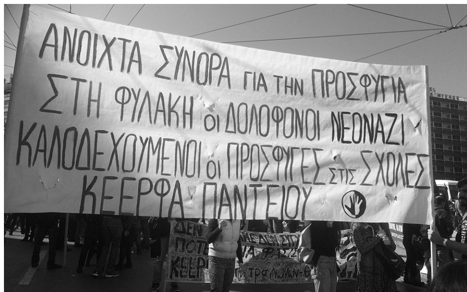
KEERFA banner at March 18 protest in Athens raises utopian call to “Open Borders for the Refugees” and promotes illusion that capitalist state will “Imprison the Neo-Nazi Murderers.”

The destruction of the Greek economy by the EU and its accomplices in the Greek bourgeoisie has led to the increased pauperization of the working class and also of a significant section of the petty bourgeoisie. While working people have