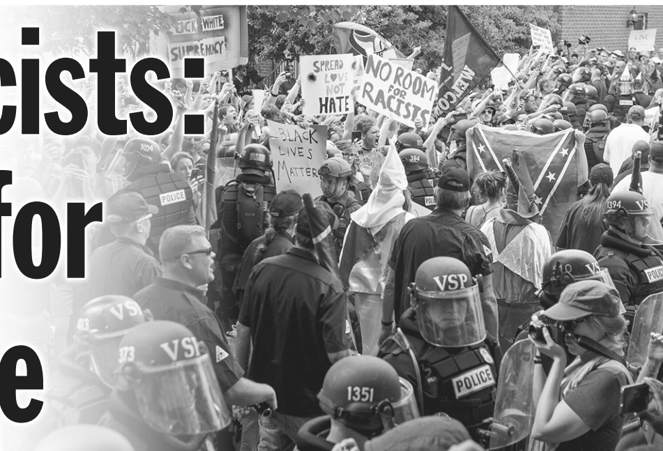
Cops (above) in Charlottesville protected KKK rally from thousand-strong anti-fascist counterprotest, July 8.