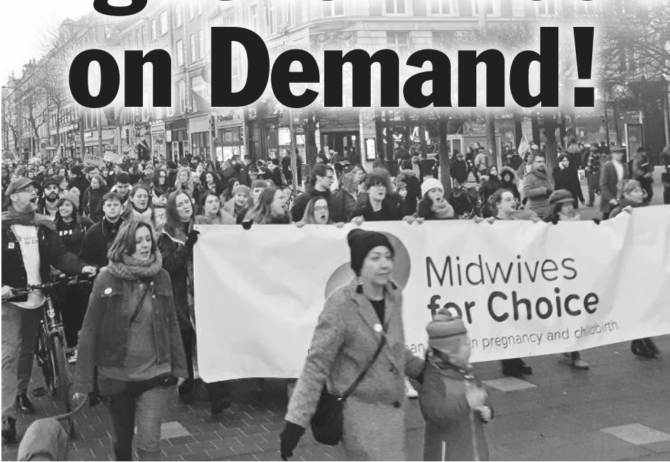
March 8: International Women's Day protest in Dublin demands abortion rights.

Under pressure from a population fed up with reactionary Catholic Ireland, the government is promising legislation to allow abortion, possibly on request in the first twelve weeks of pregnancy. If it became law, such a provision would certainly be welcome. It would be a more liberal regime than that in Britain, where women (including thousands of Irish women every year) are required to get two doctors to attest that continuing their