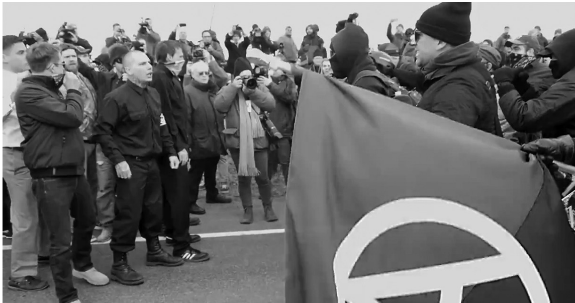
March 5: Anti-fascist protesters confront neo-Nazis outside Richard Spencer rally for race-terror at Michigan State University.

On March 5, hundreds of activists came out to oppose would-be führer Richard Spencer, who was holding a rally for race-terror at Michigan State University (MSU) in East Lansing. Fascist thugs, including the Traditionalist Worker Party, marched in formation toward the venue chanting “white power” and giving Nazi salutes, but protesters blocked the way, preventing this putrid rabble from forming up again over the course of an hours-long stand-off. Cops from eight different police agencies, on hand to ensure the fascists could mobilize, beat protesters, using bicycles as battering rams and causing numerous injuries.