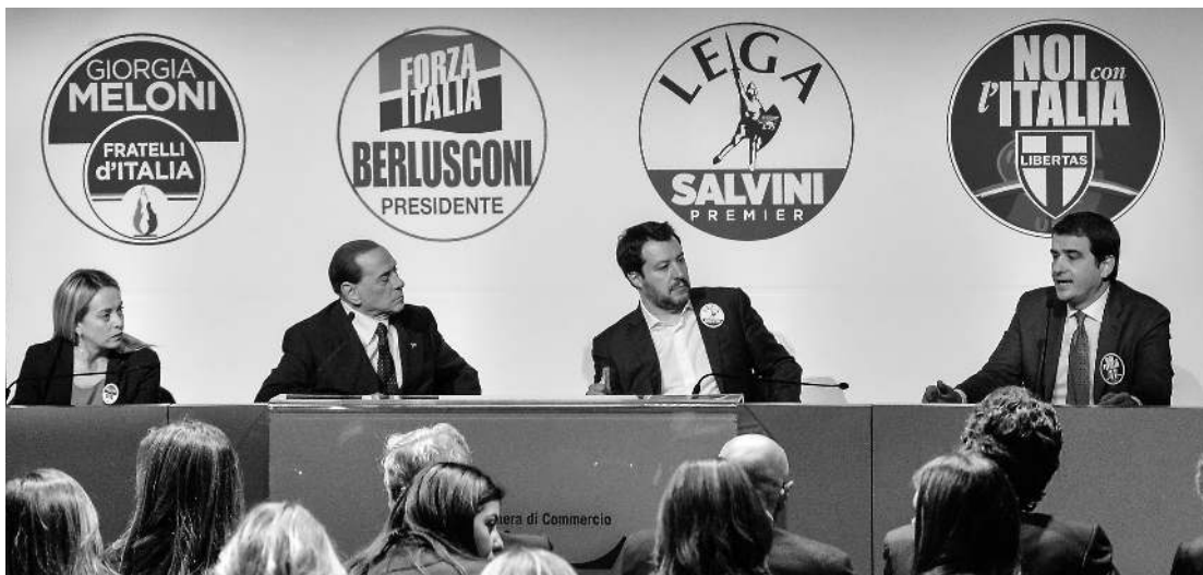
Left: Beppe Grillo and Luigi di Maio of Five Star Movement, March 2. Right: Center-right March 1 coalition meeting includes Giorgia Meloni of Fratelli d'Italia, Silvio Berlusconi of Forza Italia, Matteo Salvini of Lega and Raffaele Fitto of Noi con l'Italia.

MILANO—The results of the Italian elections on March 4 introduced a new riddle for the Italian bourgeoisie and the Euro-imperialists. The result was a hung parliament dominated by forces that are not part of the mainstream bourgeois establishment and that have at times opposed the European Union (EU), although in their bid for government they made it quite clear that they are willing to support the EU.