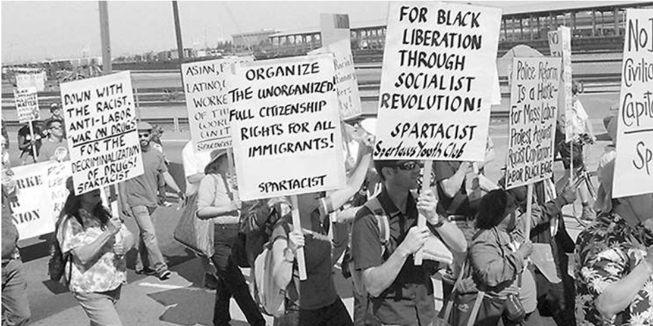
May Day 2015: Spartacists raise call for full citizenship rights for immigrants at ILWU longshore union march against racist cop terror in Oakland.

or prohibit” I.C.E. and Homeland Security “from doing their own work in any way.” While barring police and other state agencies from sharing certain information about prisoners with I.C.E., it exempts those who have been convicted of any one of 800 crimes . Moreover, regional police databases, which include data provided by sanctuary cities, are readily available to immigration authorities. At Brown’s insistence, the law also allows I.C.E. to work with state prisons and enter county jails to question immigrants. Another of these laws, purportedly preventing I.C.E. agents from hunting down “illegals” at their work places, merely requires that these anti-