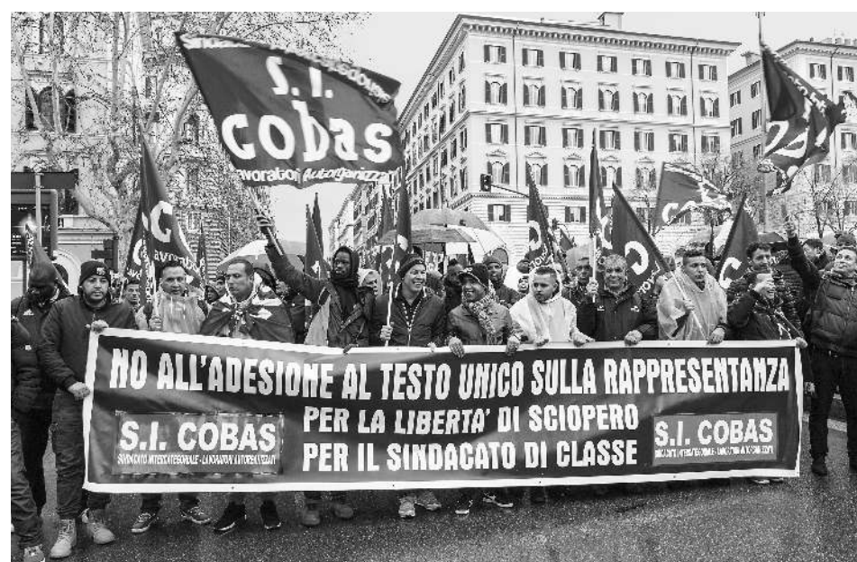
Rome, February 24: Thousands of COBAS union members, including many immigrants, protest against the “Jobs Act” and in defense of immigrant rights.

ning against the PD, Lega and M5S, none of which represented even a deformed expression of working-class independence.