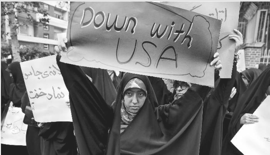
Left: During Macron's visit to Washington to appeal for maintaining Iran nuclear deal, Trump gives French president le grand brush-off , April 24. Right: Iranian protesters in front of former American embassy in Tehran denounce U.S. withdrawal from accord, May 9.