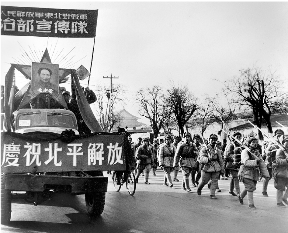
Chinese Communist forces enter Beijing in 1949, ousting imperialist-backed regime and sweeping away capitalist rule.

able to infiltration by the Chinese government. Education is Australia’s third largest export (after coal and iron ore) and many universities are financially reliant on full-fee paying international students, almost one-third of whom are Chinese. Numbering some 160,000, Chinese students are increasingly portrayed by reactionary forces as either potential dupes of, or spies for, the Chinese government. Supposedly “brainwashed” Chinese students, under the thumb of Chinese agents or consular staff, are penetrating Australian campus life and using their collective economic clout to pressure university administrations to tamp down on academic “freedoms.” Thus, the story goes, these students are deliberately undermining, if not gutting, Australia’s “democratic values” from within on behalf of the “evil puppet-masters” of the CCP.