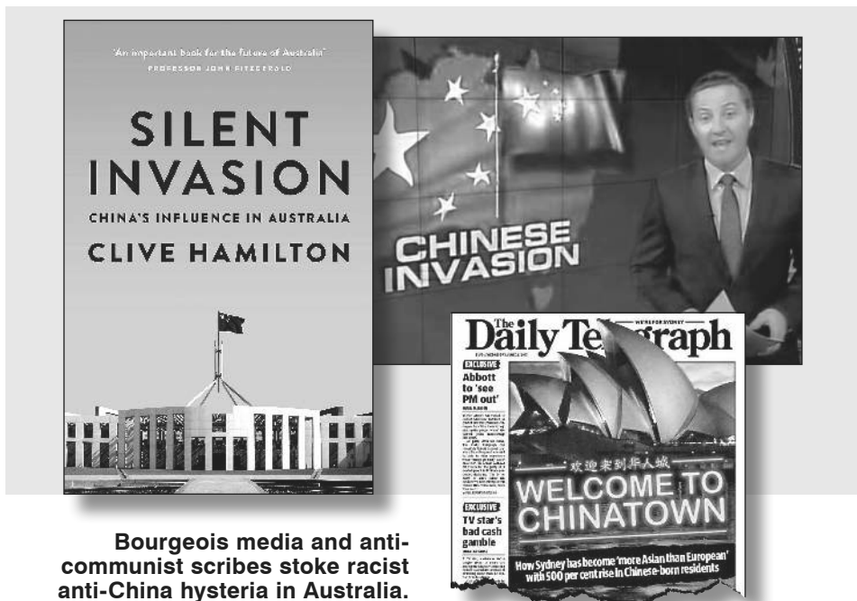
Bourgeois media and anti-communist scribes stoke racist anti-China hysteria in Australia.

Acting as top cop of the southwest Pacific and junior imperialist partner to