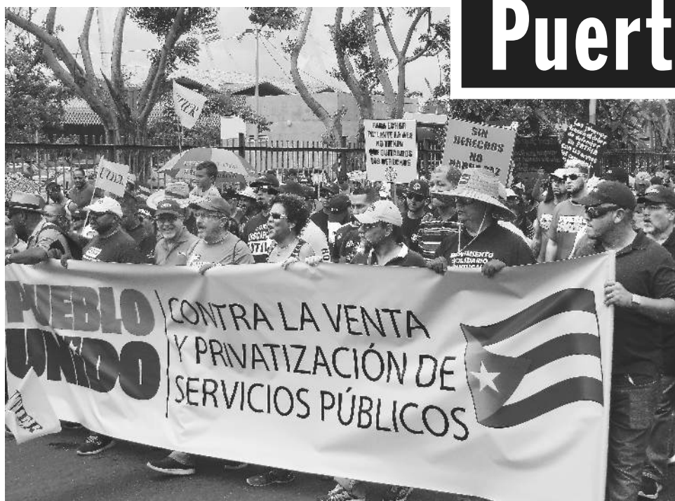
Public workers march in San Juan, May 1. Trabajadores públicos marchan en San Juan, Primero de Mayo.