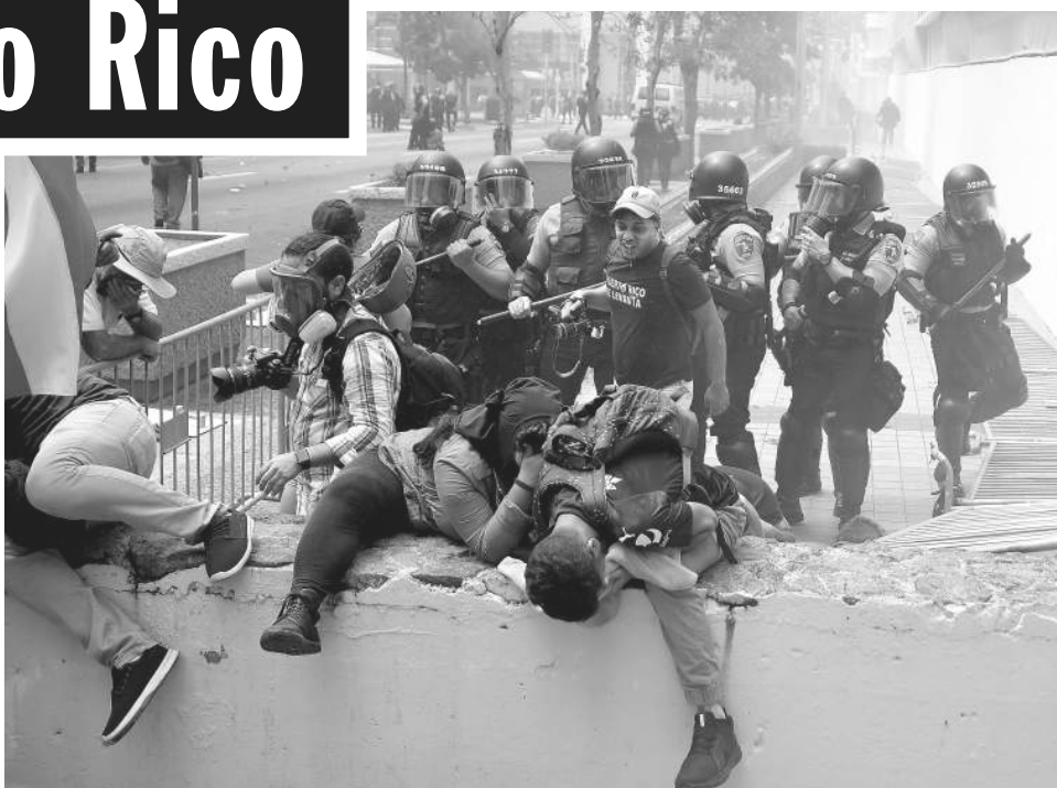
Riot police attack protesters. Policías antimotines atacan a los manifestantes.