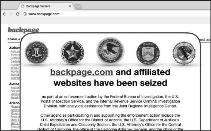
L.A. vice squad rounds up women suspected of prostitution, May 2017. In a sinister act of internet censorship, FBI seized Backpage.com on April 6. Such website closures drive sex workers onto the streets.

news”—i.e., allowing the public to see only what the rulers and their media deem appropriate. Even before FOSTA-SESTA was signed into law, Facebook shut down about 500 accounts of Palestinian journalists and publications, including the Safa Palestinian Press Agency, a major news outlet. The capitalist rulers will seek to use their augmented repressive powers over the internet to silence leftists, anti-racist activists, labor organizers and anyone else the U.S. government deems a threat.