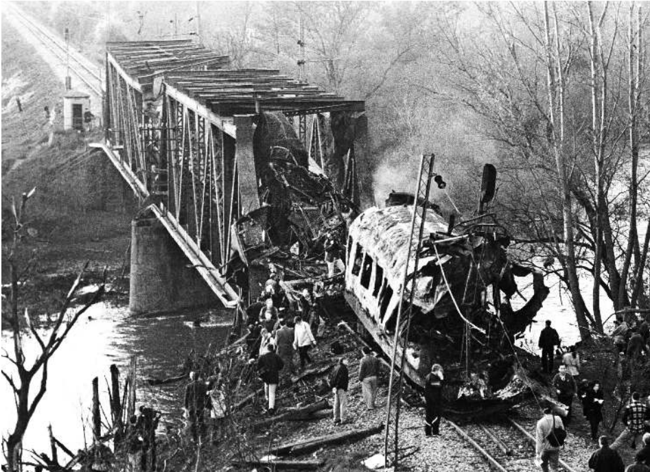
Passenger train bombed by U.S./NATO forces during Clinton administration’s war against Serbia, 1999. Bernie Sanders voted to fund this war and other bloody U.S. imperialist military campaigns.

Since our founding, we have understood that the fight against black oppression is not simply about economic betterment. The struggle for black freedom in this country is part of the struggle of the working class as a whole, but is also more than that struggle. Black workers, specially oppressed and exploited over generations of degradation and humiliation, form the most conscious and experienced section