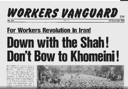
Spartacists warned against Khomeini’s Islamist forces, called for workers to power (WV No. 221, 15 December 1978). Mullahs’ regime was disaster for workers, women, national minorities. Right: January 1989 Spartacist-initiated protest in New York City against mass executions of Iranian leftists.

“The president is now in the middle of a trade war with China that by his own logic is far more important to long-term American interests than some immediate breakthrough or regime breakdown